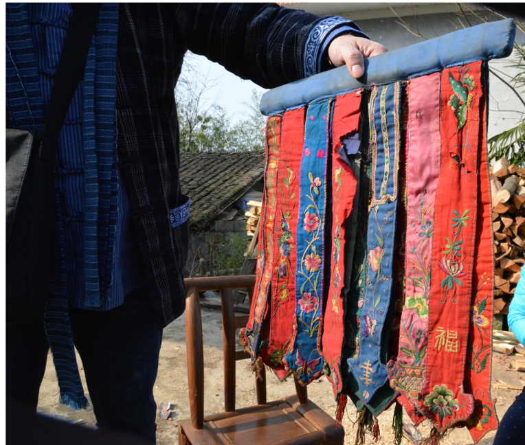
Figure 3. A liu jin used by badai to sweep away evil spirits. Each cloth was embroidered by families from the village and given to the badai to protect the village..

must clean all the persons, animals, take baths, and change the mattress's clothes. Everything must be clean (Yang 2018a).