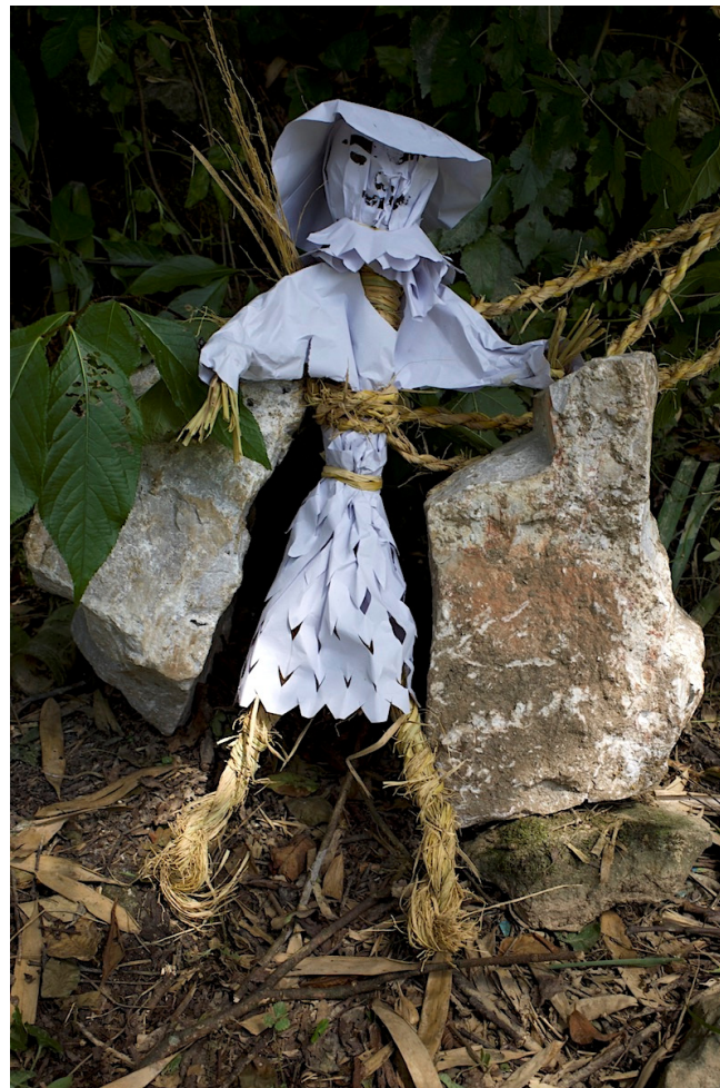
Figure 14. The Doll Ghost, which is performed in nearby woods.

At sunset, the Big General Doll Ghost ritual was initiated at the altar and continued with the sacrifice of a rooster in an adjacent field (Figure 14). If practiced otherwise, it can bring bad luck and damage the ritual’s effect (C. Shi 2018b).