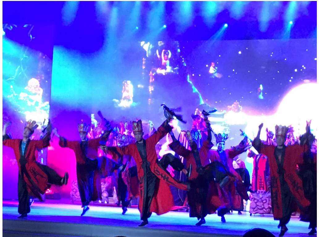
Figure 1. A theatricalized performance depicting Badai. Created and presented by actors for tourists and without any spiritual or ritual significance. Shanjiang Miao Tourist Village in Fenghuang County. 2018.

artisans (Figure 1). Theatricalized badai shows worthy of Las Vegas are what is presented. A large-scale zhuiniu ritual, which included a sacrifice, was part of the local government's tourism and employment initiatives. These initiatives were shaped as sensationalized entertainment yet careful to downplay "superstition" or ethnic identity, two issues the Chinese Communist Party (CCP) has deemed anathema to its efforts to modernize and unify the nation under party rule.