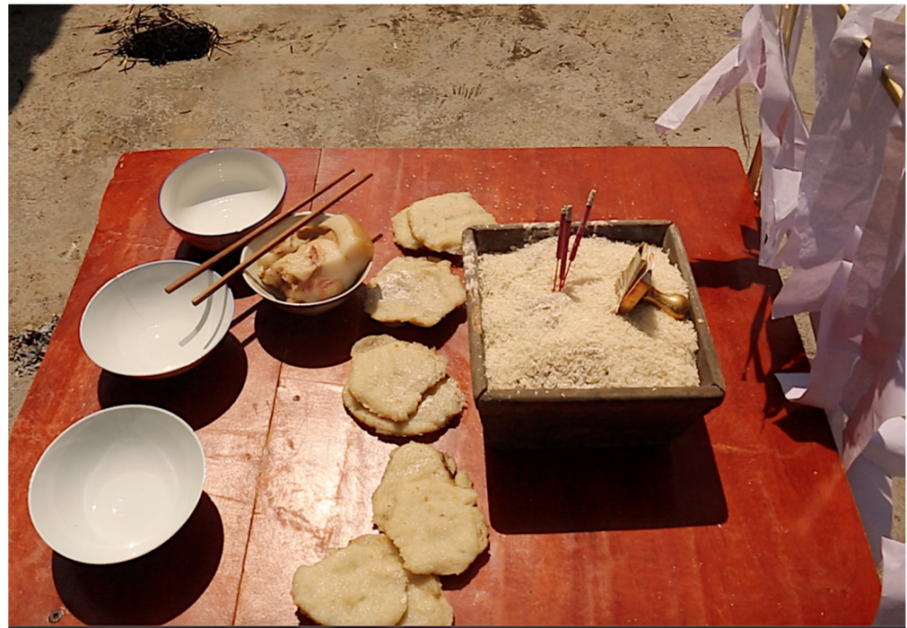
Figure 9. The table altar setting for the first phase of the tali tree ritual.