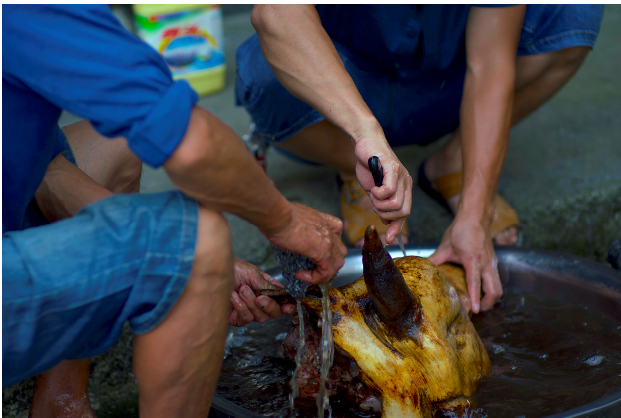
Figure 7. The flaying of the ox head by members of the host family to make the meat an offering to the gods.

Yang then sang to the armies. The armies are “From the past, from the very beginning of ancient times and do not use modern weapons, only spears and shields” (Hong 2018c). The soldiers from five different directions/heavens are asked to gather at the center between the two altars where the “barracks” are located.