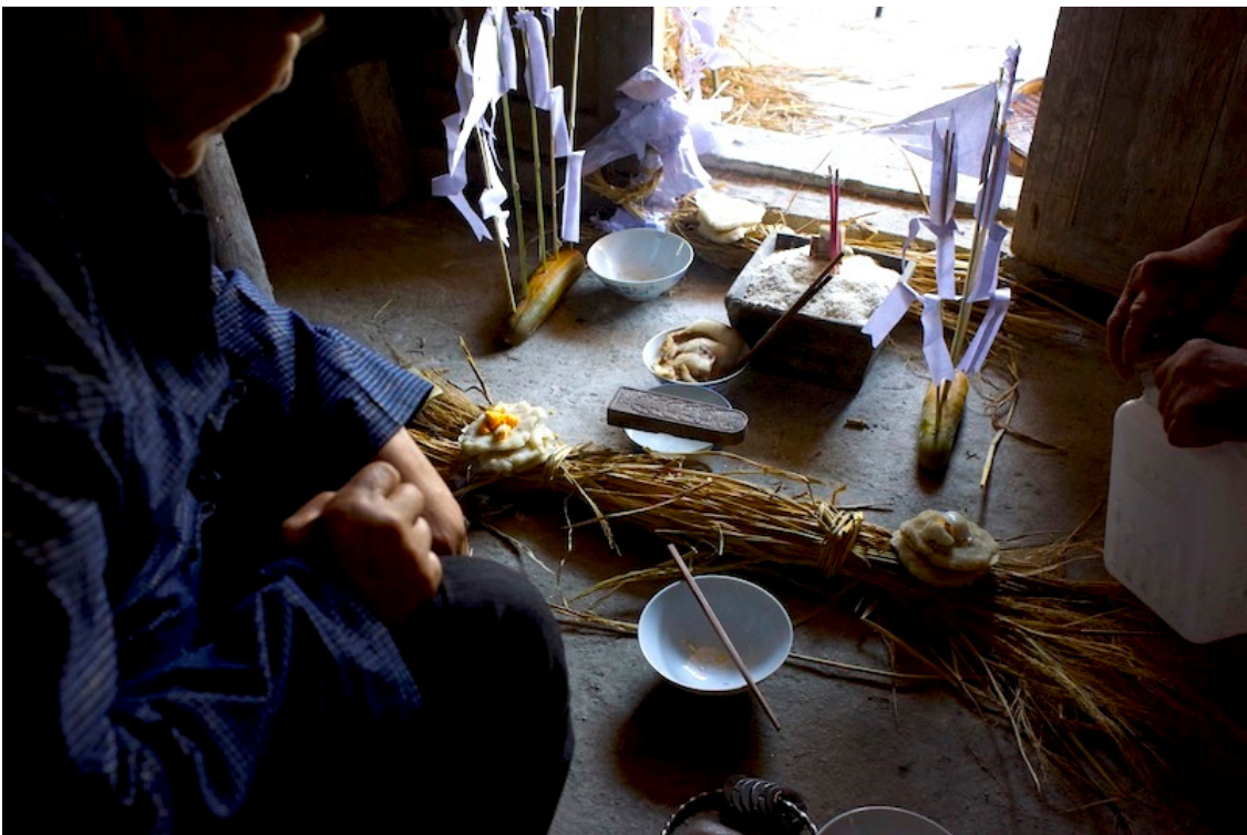
Figure 5. Badai Shi Changwu at the right altar in front of the main door to the family's home.

Traditionally, this ritual began at midnight. For the La Yi re-enactment, it was conducted mid-day. 19