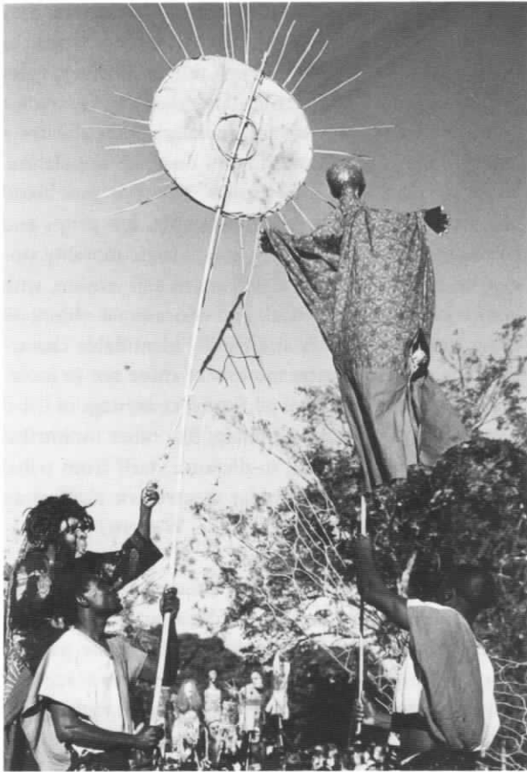
Photo 6: The Nyambe puppet (carried by Timothy Muga) travels to the far side of the sun.