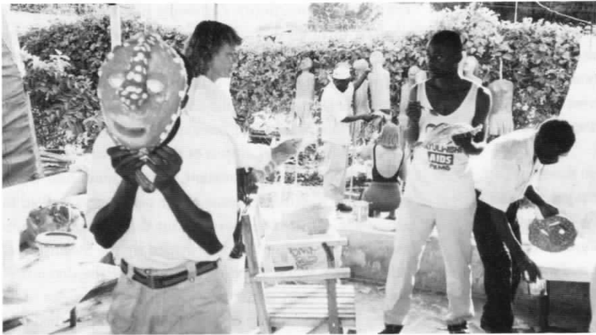
Photo 7: A mask workshop in the Finnish Volunteer Service compound, Lusaka.